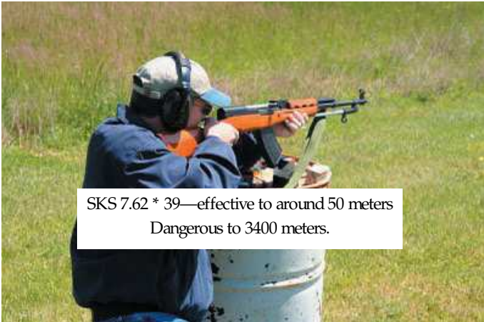
SKS 7.62 * 39—effective to around 50 meters Dangerous to 3400 meters.